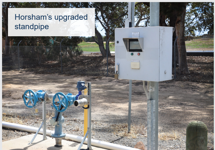
Horsham's upgraded standpipe

This change improves convenience and security and reflects our commitment to better water services across the region.