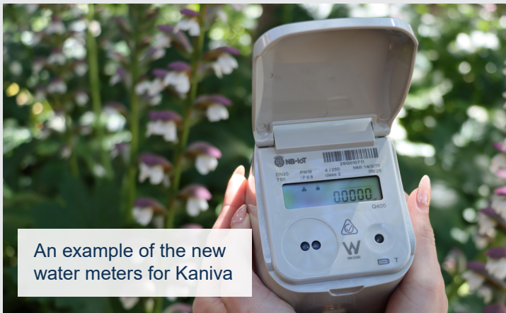
An example of the new water meters for Kaniva

These meters provide near real-time water usage data via our free Customer Portal, leak alerts to prevent unexpected bills, and pressure monitoring to help us detect issues early and improve services.