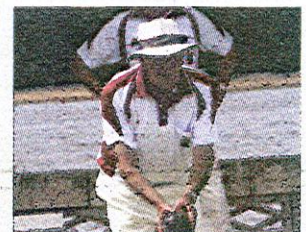
Sport, p 10-12.