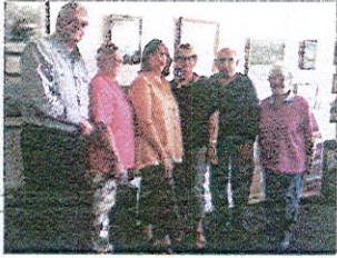
New art committee, p3.