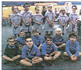
New at school, p 5.