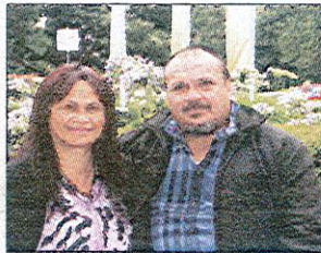
Tree change cleaning, p 6.